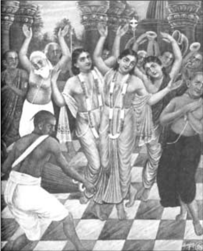
Śrī Chaitanya Mahāprabhu and associates ecstatically chanting the Hare Krishna mahā-mantra .

index finger, which is generally considered inauspicious, should not touch the beads, but should remain outside the bag. Generally we use the thumb and middle finger to count. One should chant sixteen rounds, as recommended