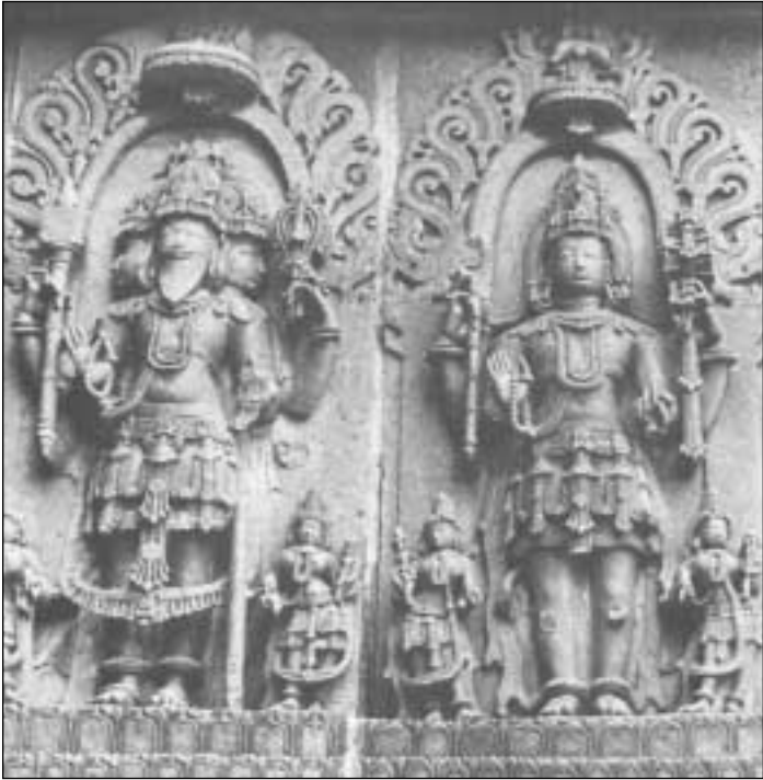
South Indian relief of Lord Brahmā, the creator of the universe (left), and Lord Śiva, the universal destroyer (right).

Vedas singing praise to Lord Brahmā. Nārada, who was also his son and disciple, approached Lord Brahmā saying, “How greatly fortunate you are! You are entrusted by Lord Nārāyaṇa Himself with the management of the whole universe, and sometimes you visit Him for guidance in the administration of the universe. We also find that some portions of the Vedas are engaged in singing your glories. You are so fortunate!”