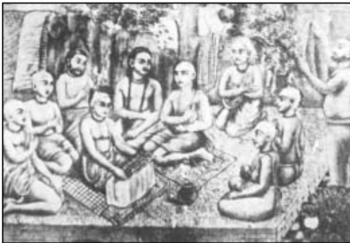
A sixteenth century painting of Śrī Chaitanya Mahāprabhu and His associates discussing Śrīmad-Bhāgavatam .

will find the key, the clue to the proper world where life is worth living.