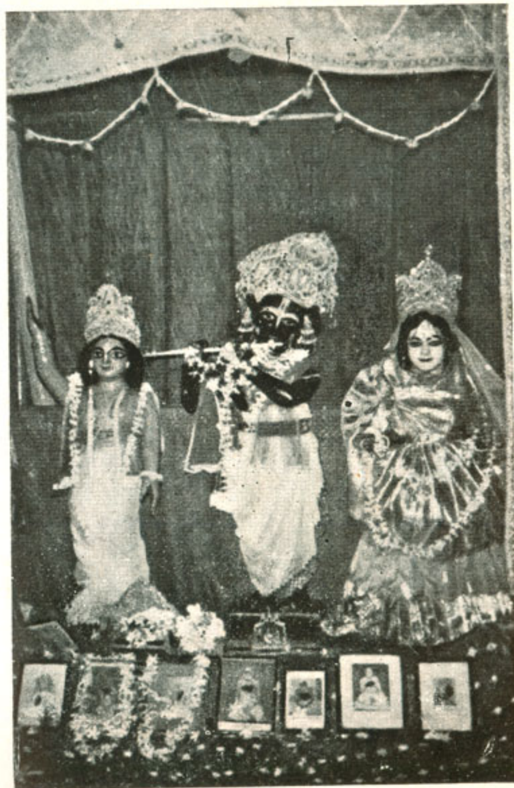
Sri Sri Guru-Gauranga-Gandharva-Govinda Sundarjiu Sri Chaitanya Saraswat Math

So when one dies it may be possible, but it is not sure, that a brahmana will again be a brahmana in his next birth. If he has done some previous bad action then that may take him to the worst position, whereas a candala who is finishing his lowest form of life may come to be a brahmana at once. According to karma , and the intensity and priority of the karma , the results have their effects.