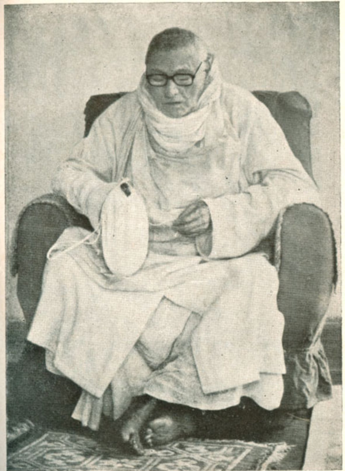
His Divine Grace Srila Bhakti Raksaka Sridhara Deva Goswami Maharaja