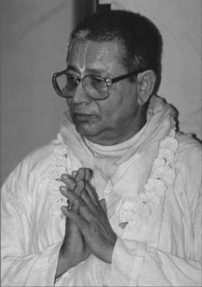
President-Āchārya Śrī Chaitanya Sāraswat Maṭh Śrīla Bhakti Sundar Govinda Dev-Goswāmī Mahārāj