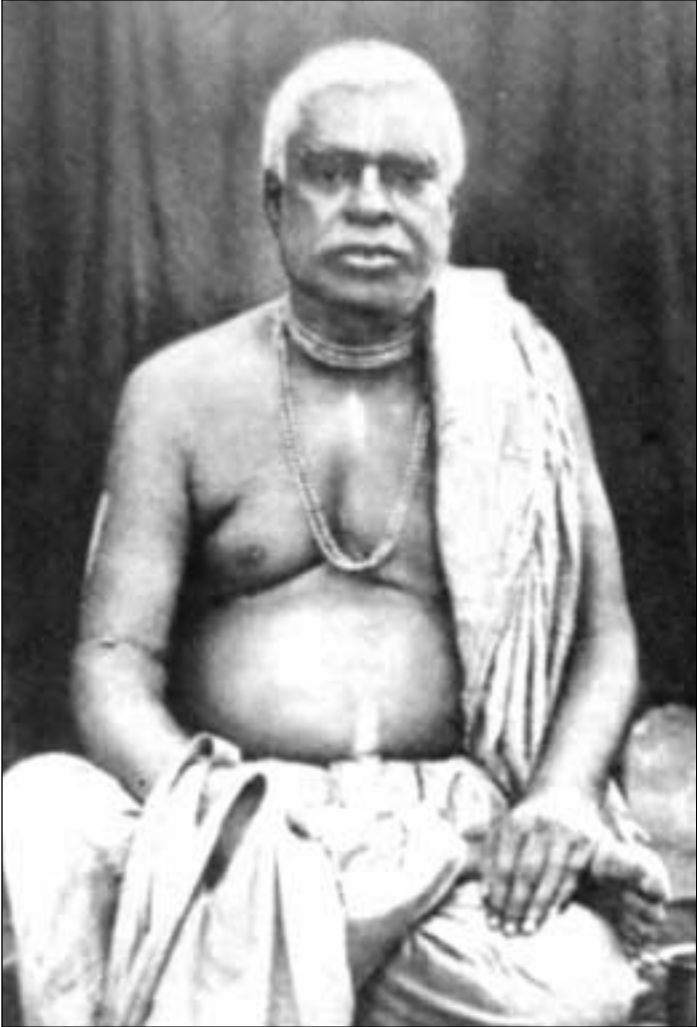
Śrīla Bhaktivinoda Ṭhākura