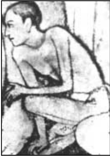
Śrīla Rupa Goswāmī

aspect of devotion will gradually come out. And we shall be able to dive deep into reality. As we give up the external covers, and we experience what may be considered as death in the external world – die to live – we shall enter into the inner side more and more.