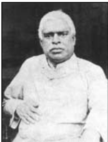
Śrīla Bhaktivinoda Ṭhākura

What Bhaktivinoda Ṭhākura saw in his mind must exist somewhere in this world, sometime in the future, or sometime in the past. That very thing he describes in an apparently fictional way actually existed. Let me give you an example. When I speak, the sound moves at