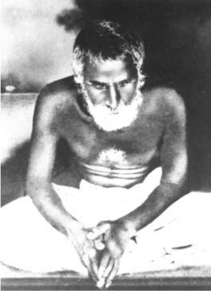
Śrīla Gaura Kīṣora Dāsa Bābajī Mahārāj