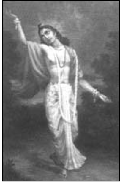
Śrī Chaitanya Mahāprabhu

How this is so can be understood by the analogy of a drama. In a drama in the theater, an actor may play the part of a dead man. As his body is being carried, he can't say anything; he can't move. That does not mean that he is dead. Similarly, a devotee in śānta-rasa may assume a passive role as a creeper, a shrub, or a tree in Vṛndāvana, in order to enhance the drama of Rādhā-Govinda līlā .