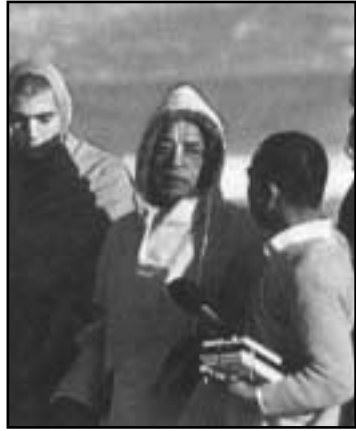
Śrīla Bhaktivedānta Swāmī Mahārāj

Śrīla Śrīdhara Mahārāj: No. Realization of spiritual reality is independent of all material contamination or misconception. That injection into our soul is given by Vaikuṅṭha, by the eternal associates of Viṣṇu. Perceiving spiritual reality is the function of